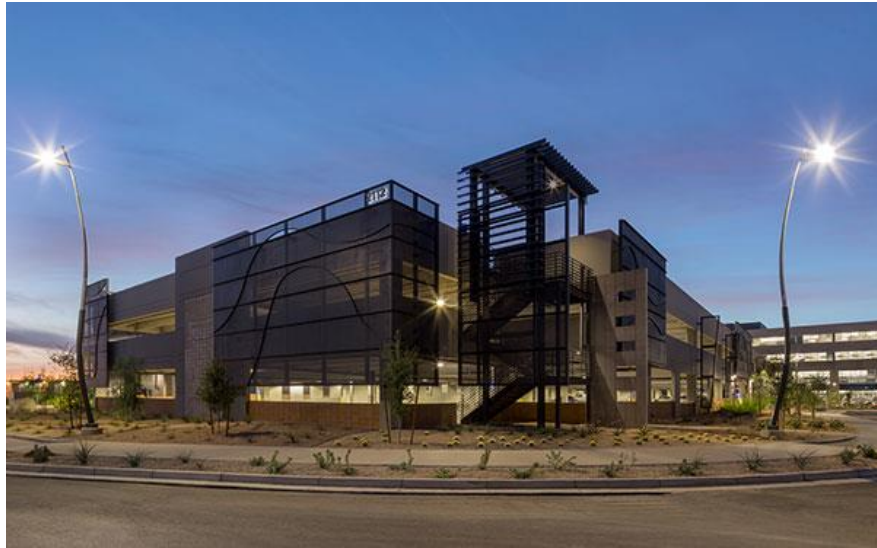
This project was completed on April 2018.